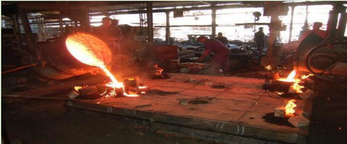
Industrial Cast Iron Casting