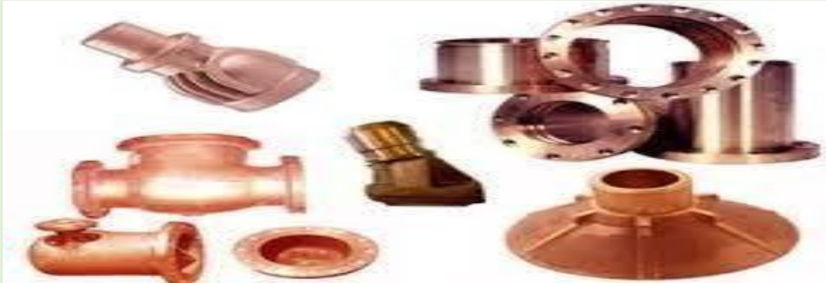
PB1 and PB2